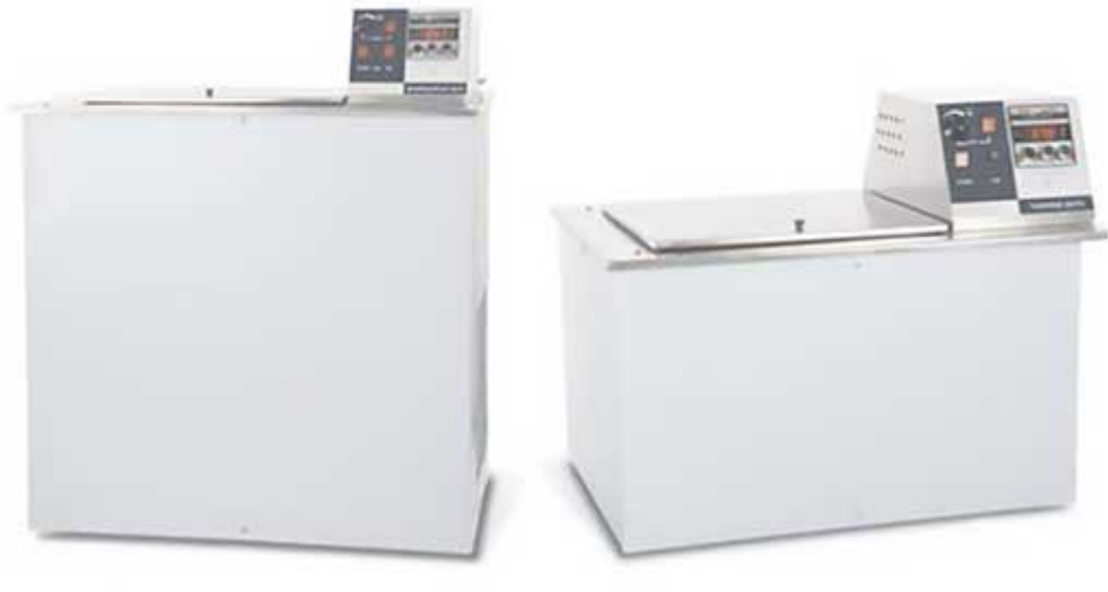
Plasma Thawing Bath

Solutions for Pharmacology, Bio-Chemistry, Clinical & Industrial Laboratories and R&D Equipments